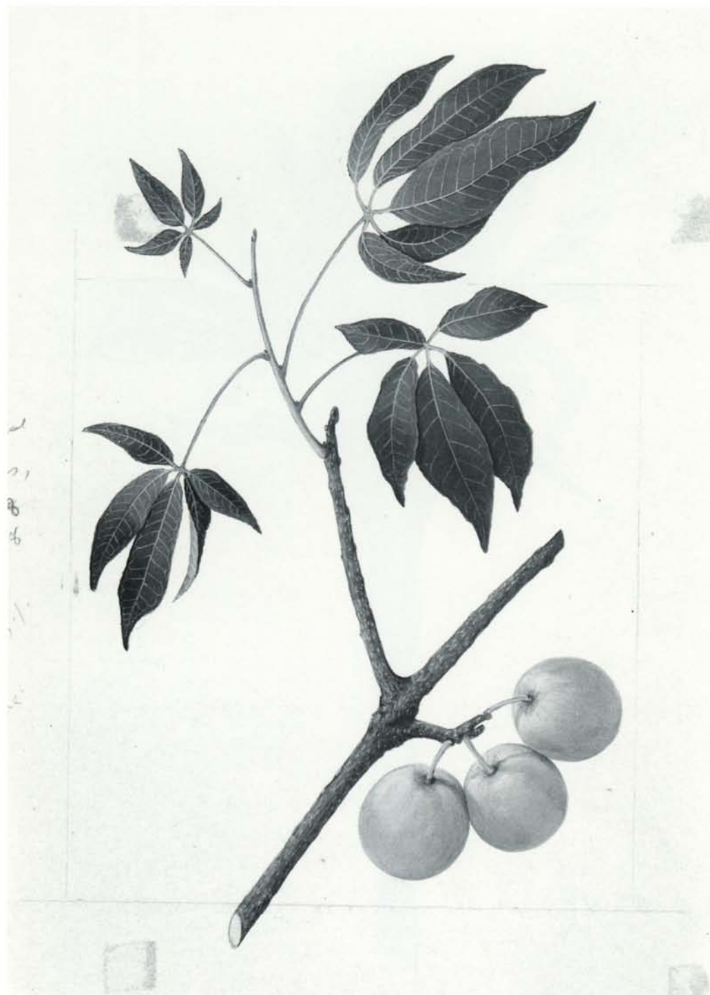
Figure 4. Watercolor of " Casimiroa edulis " (cat. no. 46).