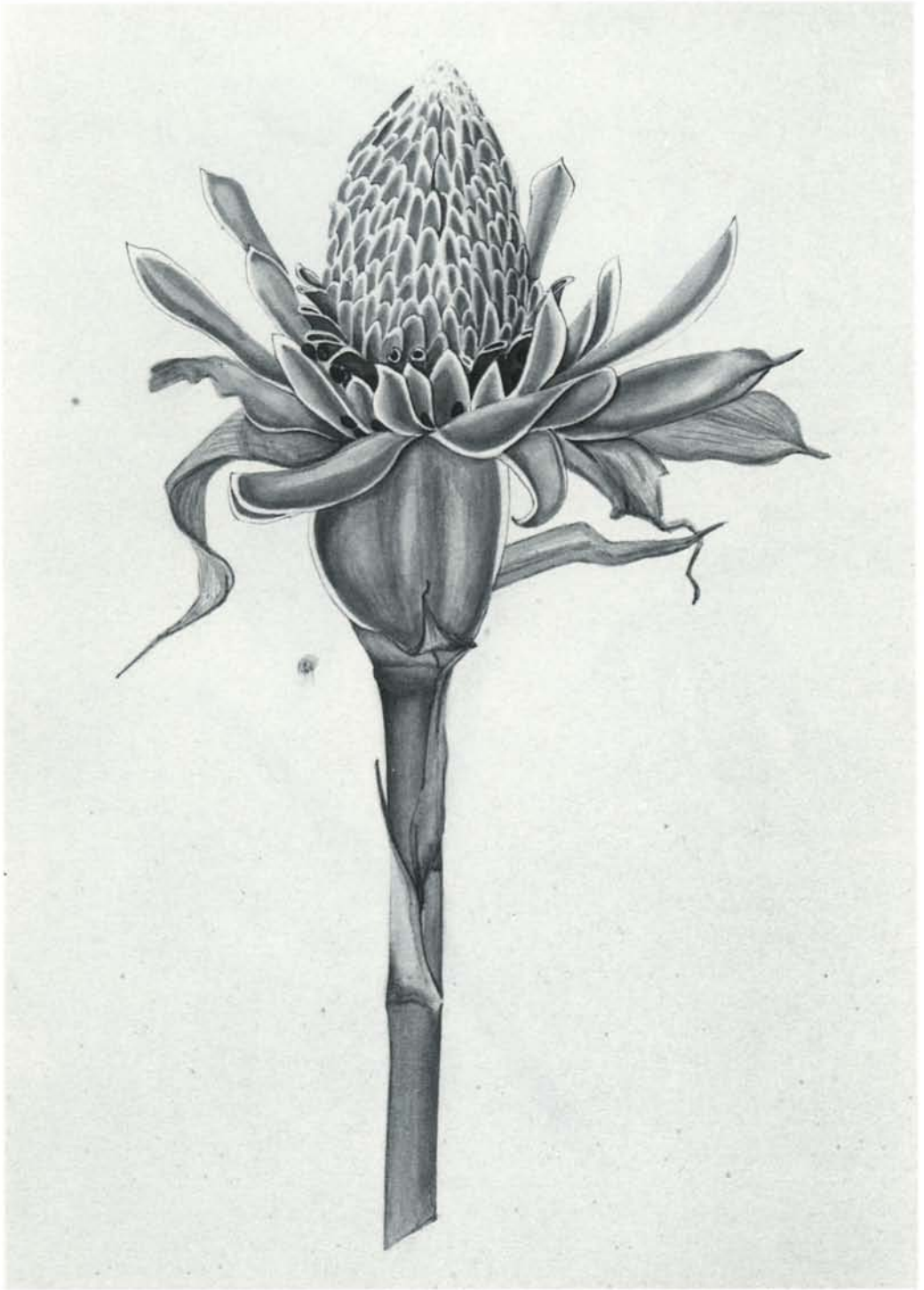
Figure 3. Watercolor of " Ammonium hemisphericum " (cat. no. 343).