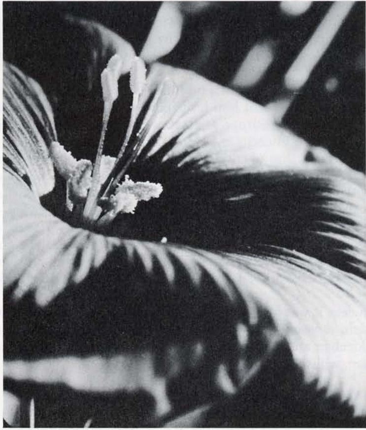
Fig. 38. Styles and stamens of Linum perenne , long-styled form (enlarged).