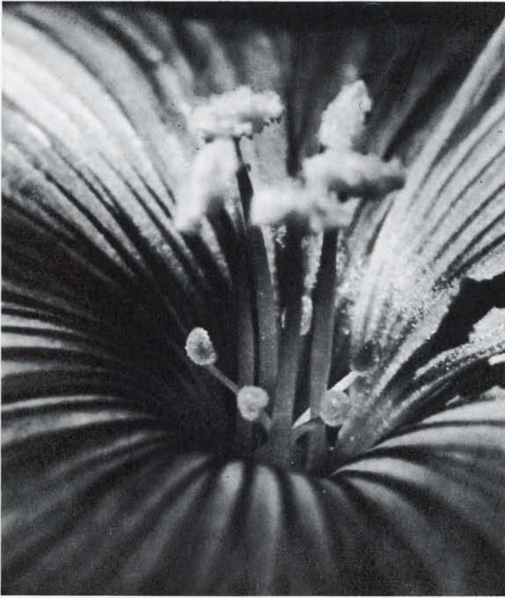
Fig. 39. Styles and stamens of Linum perenne , short-styled form (enlarged).