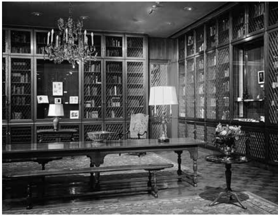
Some of the pre-1840 botanical publications in our Library are housed in the reading room, the site for special lectures and group tours.