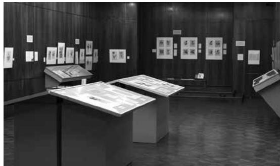
Two exhibitions a year are displayed in the gallery and often contain materials from our collections. The triennial International Exhibition of Botanical Art & Illustration focuses on contemporary art.