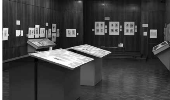
Two exhibitions a year are displayed in the gallery and often contain materials from our collections. The triennial International Exhibition of Botanical Art & Illustration focuses on contemporary art.

Please return completed form to: Hunt Institute for Botanical Documentation 5th Floor, Hunt Library Carnegie Mellon University 4909 Frew Street Pittsburgh, PA 15213-3890 Telephone: 412-268-2434 Fax: 412-268-5677 Email: huntinst@andrew.cmu.edu Web site: http://www.huntbotanical.org