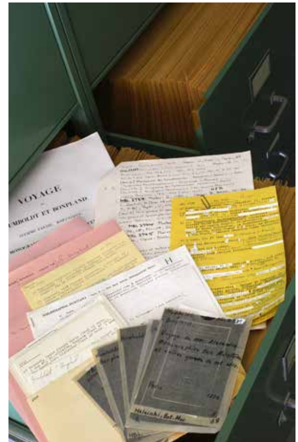
A tiny sample of some of the data we hold on over 34,000 botanical books published 1730 to 1840: "field" notes, title-page photos, "work" sheets and drafts for the final bibliographical entry for Humboldt & Bonpland's Voyage aux ... Nouveau Continent .

I am a current Associate or a member of Carnegie Mellon and will receive a 25% discount.